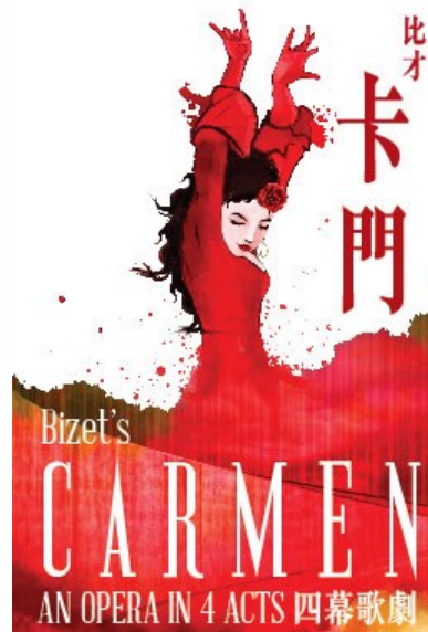
Caption: Opera Hong Kong kicks off 15th Anniversary programme with Carmen .