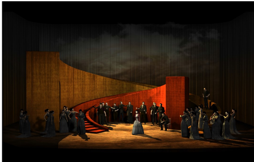
Caption: Rendering of rotating set for Carmen , designed by Bruno de Lavenère, courtesy of Opera Hong Kong

Bizet's tale of desire and revenge presented by OHK and Le French May