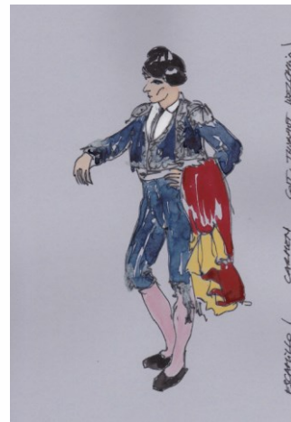
Caption: Costume sketch of Escamillo, courtesy of Opera Hong Kong and Thibaut Welchlin